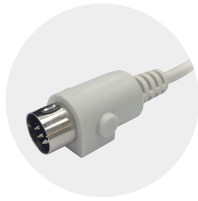
U-type (5-pin DIN plug)